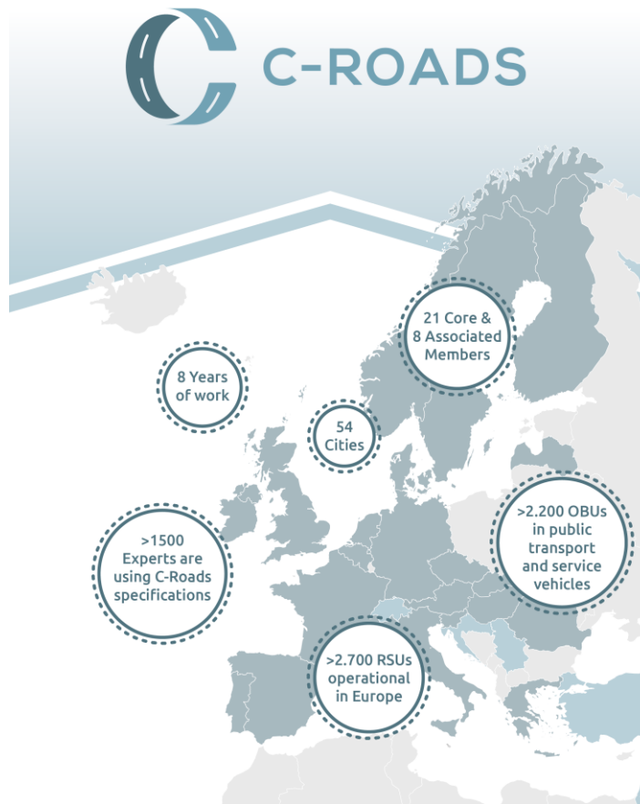
Figure 1: Overview of C-Roads coverage